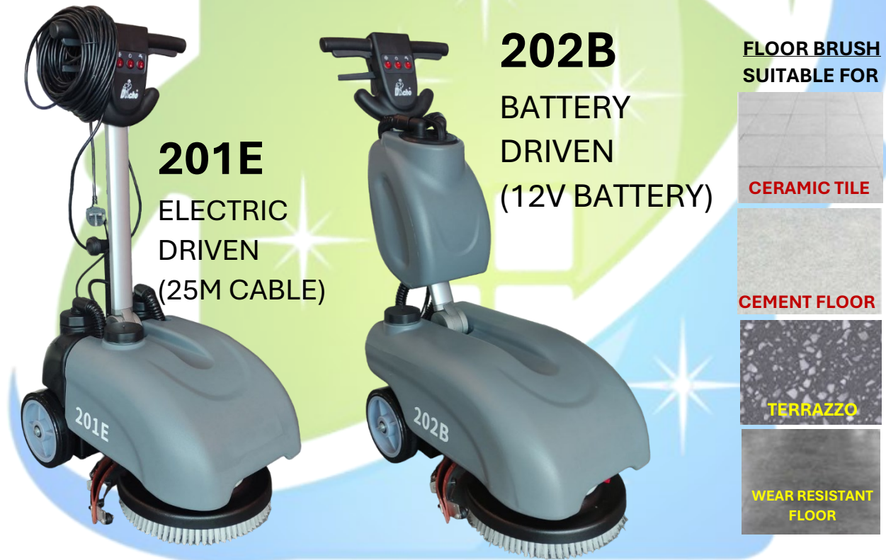
201E ELECTRIC DRIVEN (25M CABLE)